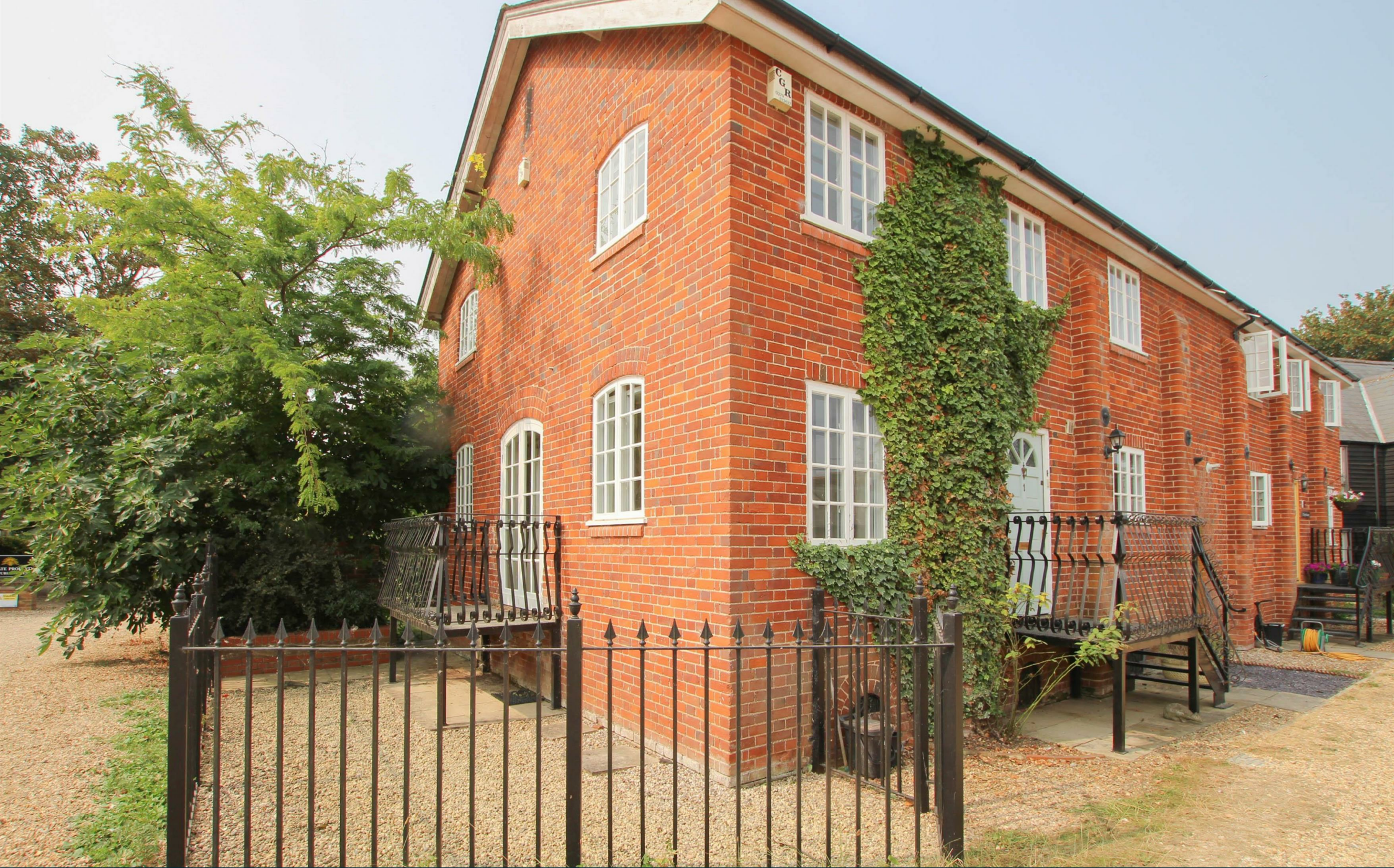
The Granary, Great Chesterford, CB10 1PE